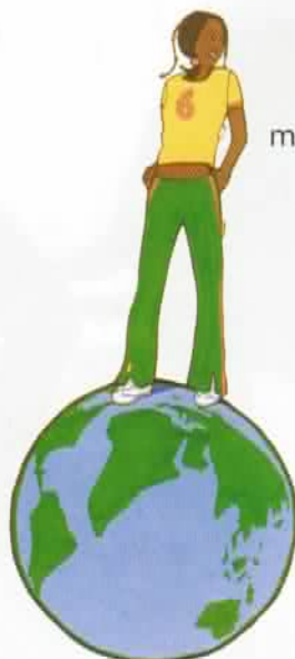
Sharon's mass is 66 kg